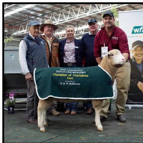
2024 Champion of Champion Ewe – Rene Stud