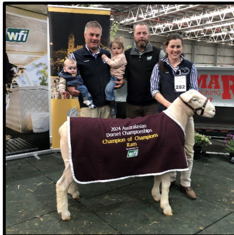
WFI 2024 Champion of Champion Ram – Yentrac